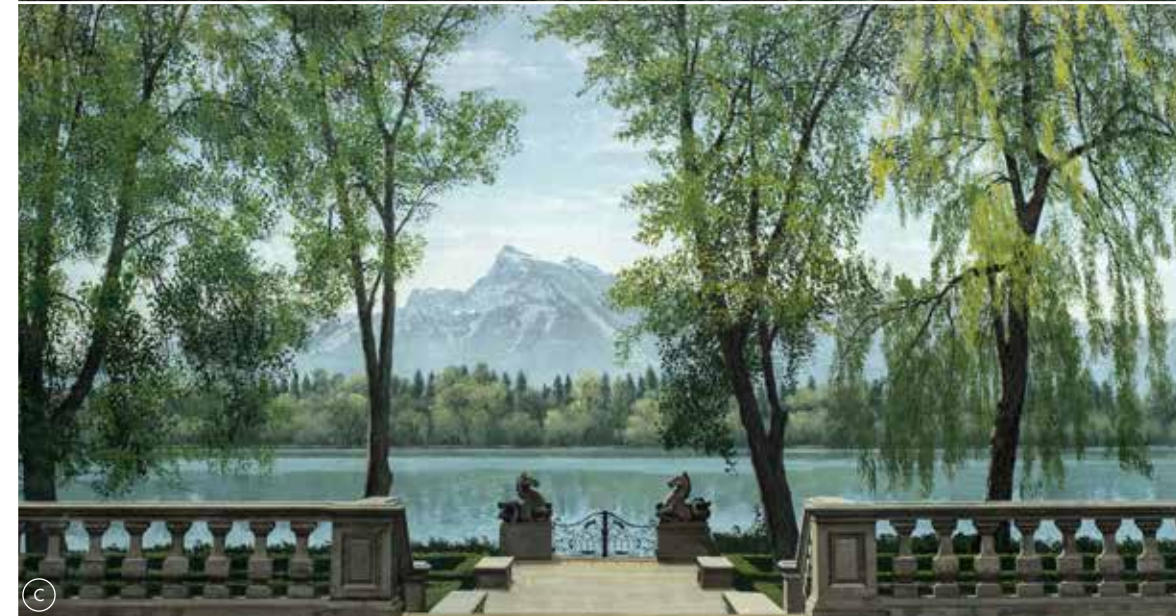
A. HAIL CAESAR, UNIVERSAL (2016), BEN-HUR ROME BACKING REPURPOSED. DIGITAL STILL.